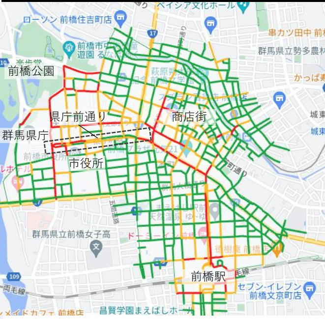
Pedestrian Analysis: 20s to 30s